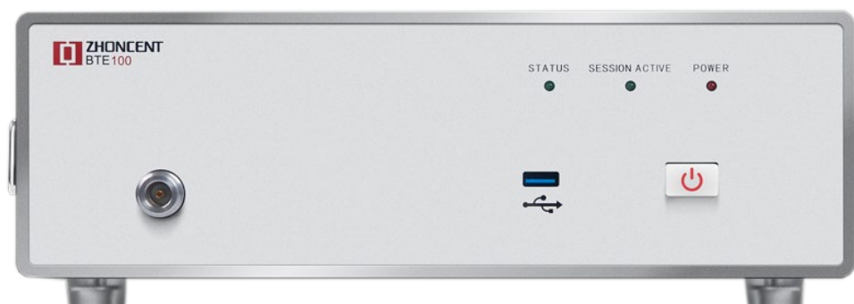
Figure 4: BTE100 Bluetooth Comprehensive Tester

For Bluetooth RF conformance testing, the BTE100 Bluetooth Comprehensive Tester marketed by Beijing Doewe Technologies Co., Ltd. fully meets the requirements.