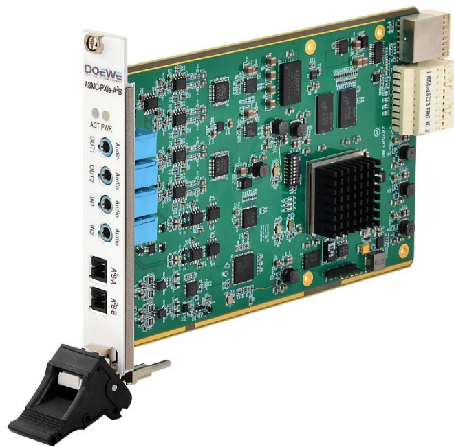
Figure 1 Side View of Doewe Technologies PXIe A 2 B Acquisition Card

In advanced cabin functions like ANC, voice interaction, and zoned audio, A 2 B network clock coherence and frame integrity determine spatial soundfield and noise cancellation effectiveness. As slave nodes increase in the chain, jitter and distortion accumulate. audioXpress tests on the 9th slave node show that the THD+N of a high-performance AK4490 DAC degrades from -109 dB to -96 dB, with the noise floor rising by >10 dB—sufficient to weaken ANC cancellation depth and disrupt microphone array phase coherence. While A 2 B chips feature built-in line diagnostics, any open circuit, short circuit, or polarity reversal triggers register-level parity errors, causing the entire daisy chain to fail instantly and resulting in "silent black screens" for infotainment systems. In NVH and safety-critical contexts, there is almost no tolerance for error.