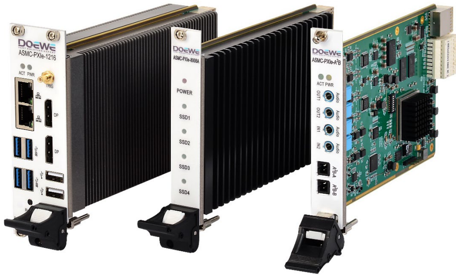
Figure 3 Doewe Technology Data Acquisition Card Combination

Doewe Technology is committed to delivering innovative, differentiated, and reliable solutions in the data acquisition field. We understand that these elements are the foundation for companies to stay competitive. That is why we draw inspiration for innovation from real customer application needs, rather than simply showcasing flashy product features. By continuously optimizing and upgrading data acquisition solutions, Doewe Technology helps partners move toward a more efficient and precise future. Choose Doewe Technology—let' s open a new chapter in data acquisition together.