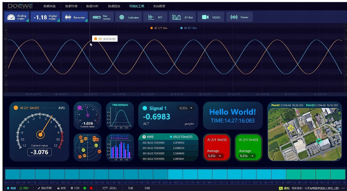
Figure 2 Automated Test and Analysis Software Overview

kit (SDK) to integrate with production-line test frameworks or in-house assertion algorithms. It supports remote control via SCPI and can synchronize multiple systems through local synchronization interfaces, GPS/IRIG, and other mechanisms, meeting the needs of expanded testing and collaborative measurements.