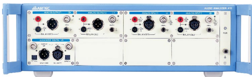
Figure 2 Audio Analyzer A10