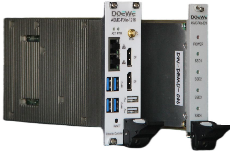
Figure 3 Data Acquisition Module

Doewe Technologies is always committed to achieving innovative, unique, and reliable product solutions in the field of data acquisition. We deeply understand that these elements are the cornerstone for enterprises to establish themselves in market competition. Precisely for this reason, our inspiration for innovation comes from the real application needs of customers, not merely to showcase flashy product features. By continuously optimizing and enhancing data acquisition solutions, Doewe Technologies empowers partners to move towards an efficient and precise future. Welcome to choose Doewe Technologies to jointly open a new chapter in data acquisition. Contact phone: 010-64327909 .