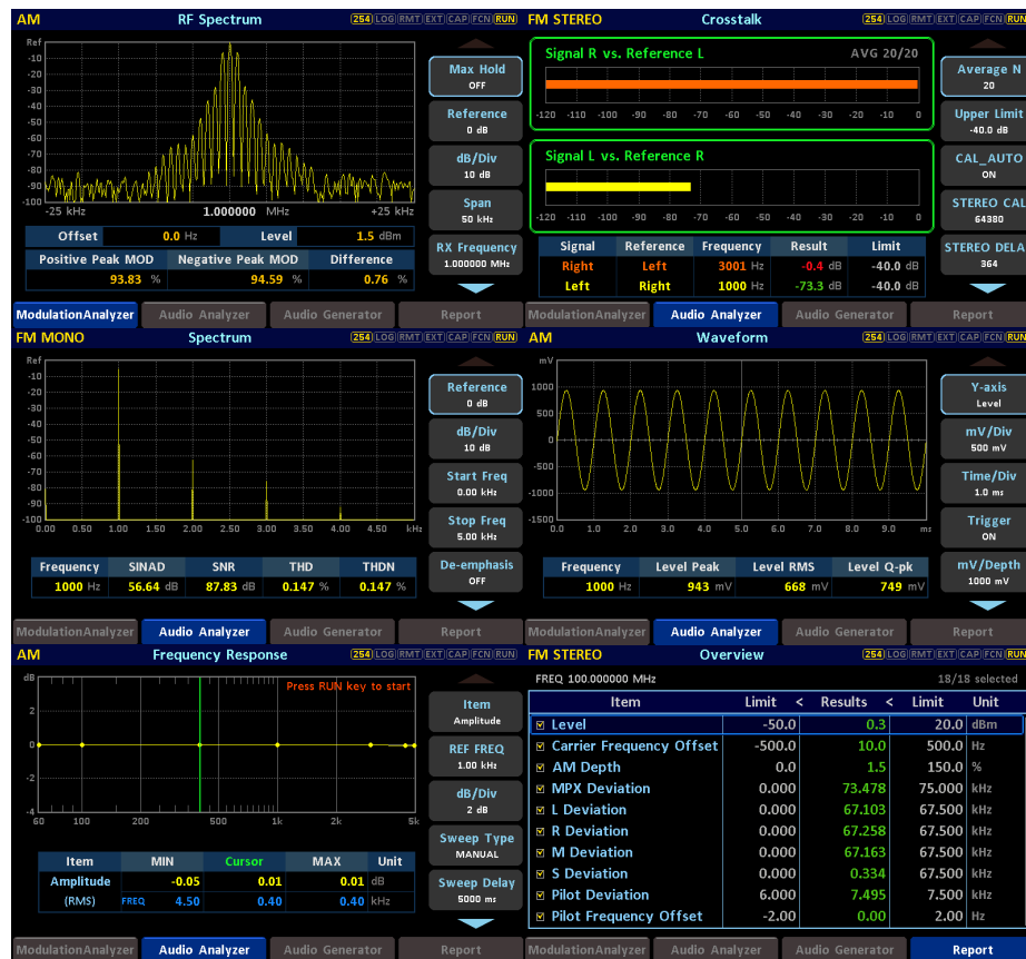
Figure 3 RWC2500A Plus Digital + Graphical Test Results

graphical approach not only lowers the barrier to entry but also makes audio analysis more precise and reliable.