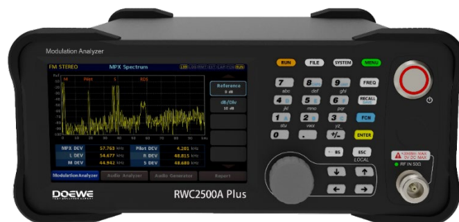
Figure 1 RWC2500A Plus Exterior

In the field of audio broadcasting, test equipment is a critical tool for ensuring communication quality, optimizing broadcast transmitter performance, and troubleshooting. The FMAB, as a classic audio broadcast testing device, has long held a significant position in the industry due to its stable performance and wide range of applications. However, with rapid technological advancements, user demands for testing equipment have also evolved. Users now require not only powerful performance but also more intuitive data visualization, more convenient operation, and greater mobility. It is against this backdrop that the RWC2500A Plus emerges. It not only inherits the reliable performance of the FMAB but also achieves comprehensive breakthroughs in waveform display, operational convenience, and portability, bringing a brand-new solution to the field of audio broadcast testing.