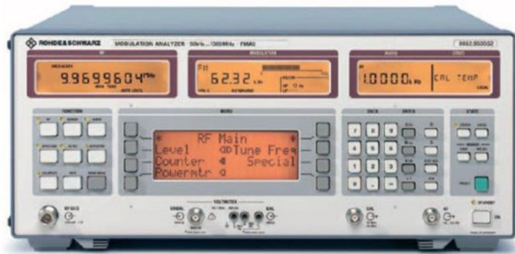
Figure 2 FMAB Digital Test Results

As a representative of traditional test equipment, the FMAB's digital display method, while accurate and reliable, requires users to possess considerable expertise and experience. This "numbers without waveforms" approach often intimidates newcomers and feels insufficiently intuitive for experienced engineers during complex troubleshooting.