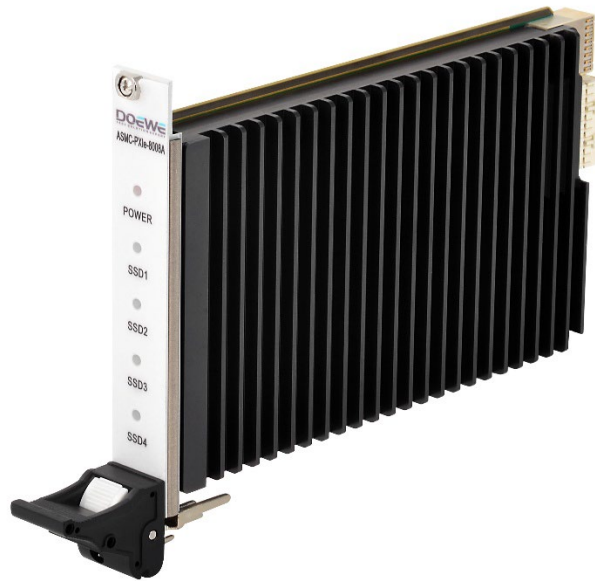
Figure 3 Side View of Doewe Technologies PXIe Storage Card

users. Our storage card products not only meet the stringent requirements for performance and stability in high-end testing and measurement systems but also provide reliable storage assurance for smart manufacturing and complex testing across various industries.