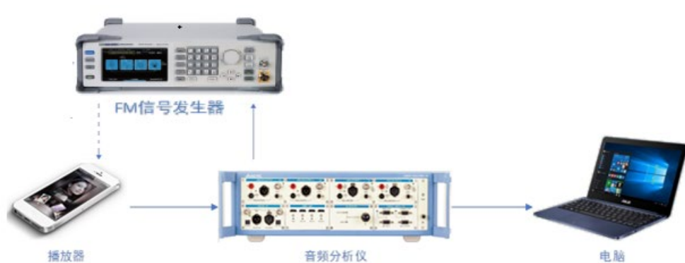
Figure 5 Player Test Connection Diagram

Description: The test system primarily includes: Audio Analyzer, Control Computer, Device Under Test (DUT - Player), and Signal Generator.