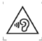
Figure 1 – Warning label (IEC 60417-6044)