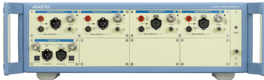
Figure 7 Audio Analyzer A5

The A5 Audio Analyzer sold by Beijing Doewe Technologies Co., Ltd. is a professional audio analyzer integrating high performance, multiple interface types, and diverse test functions. It supports a series of test plug-in extensions and various digital audio interfaces (BT/I 2 S/HDMI/PDM, etc.), making it the preferred test equipment for the R&D stage of consumer audio, automotive electronics, and other audiovisual products.