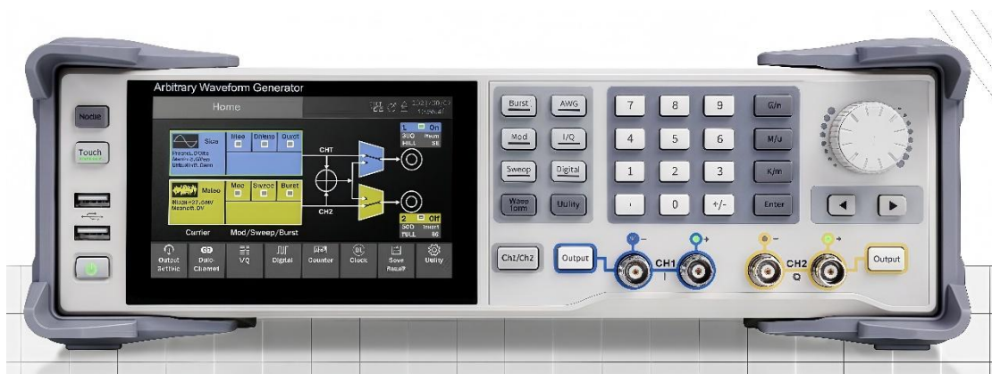
Figure 5: Arbitrary Waveform Generator Product Image