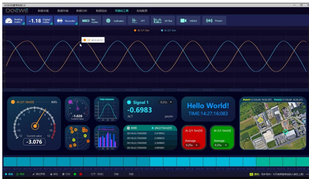
Figure 3: Diagram of Data Acquisition and Testing Analysis Software

With these features, the ASMC software fully meets the various demands of material electrical performance testing, ensuring the efficiency and accuracy of data acquisition, analysis, and report generation during the testing process. The software interface diagram is shown below: