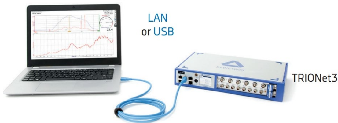
Figure 2 DAQ System Used with an External Computer

Long-duration acquisition and high-bit-depth designs significantly increase the data processing burden on DAQ systems, as they need to continuously handle large volumes of high-precision data. DAQ systems typically come with an integrated host or connect to an external computer, possessing robust data processing capabilities to meet the challenges posed by long-term, high-precision signal acquisition. This ensures the system maintains stable performance even when faced with massive data volumes, guaranteeing efficient operation. Oscilloscope design emphasizes real-time capture of high-speed signals and has certain limitations regarding long-term monitoring and large-scale data analysis. This is because the oscilloscope's processor is usually built-in and has relatively weaker processing power. To alleviate the burden of high-speed data processing, oscilloscopes typically employ lower bit depths. This helps reduce the pressure of processing data while ensuring the system can efficiently handle the data from high-speed sampling.