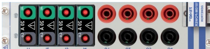
Figure 1 DAQ Board with Multiple Channels

Different application scenarios directly influence the choice of device sampling rate and bit depth. However, this choice depends not only on application requirements but is also constrained by the internal design and technical implementation of the devices. The device's sampling rate and bit depth must not only meet operational needs but also find a balance between hardware design and performance limitations.